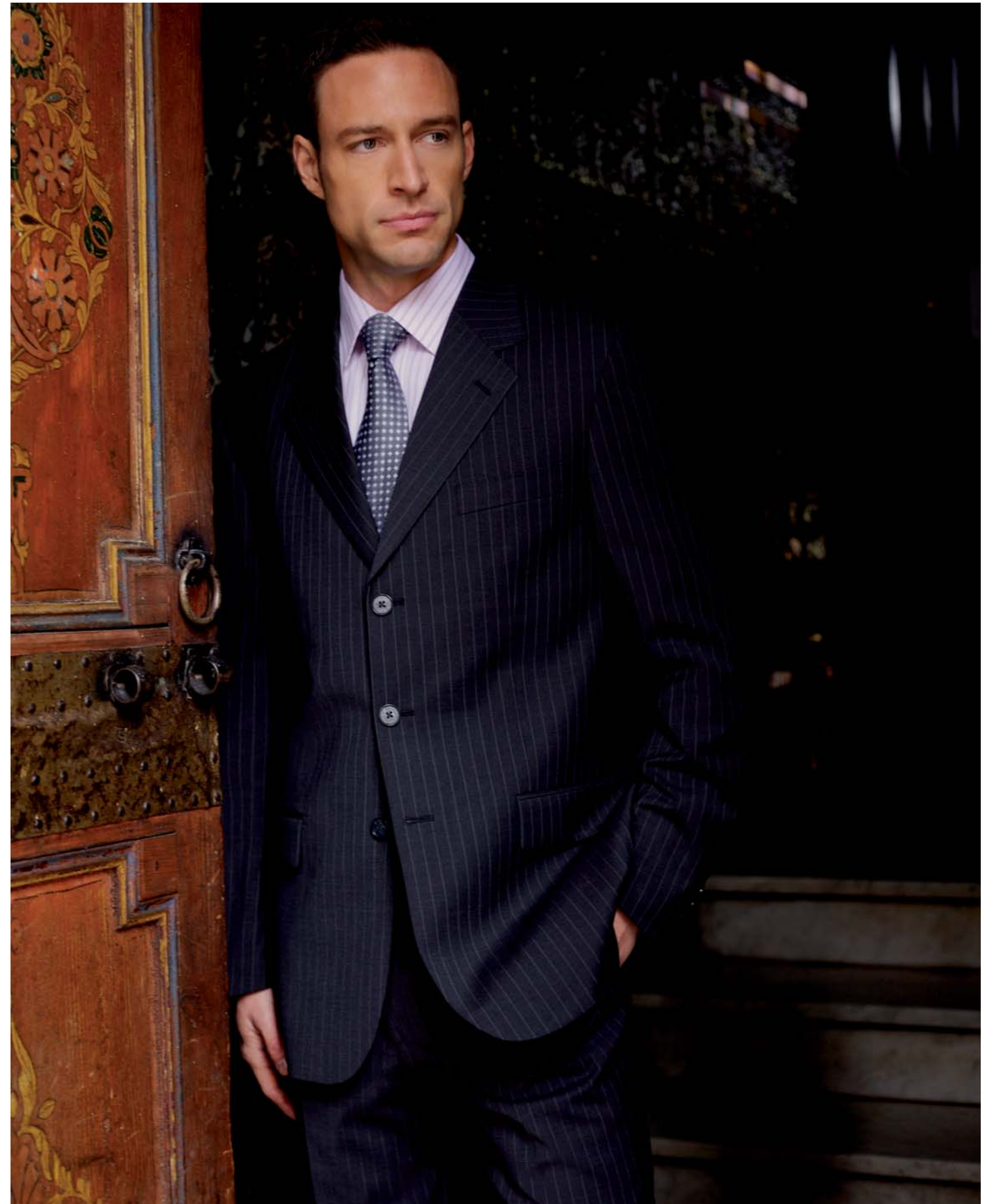
Imola Trousers (Charcoal Pinstripe) Single pleat trousers. Rufina Shirt (Pink/Grey Stripe) Long sleeve shirt.